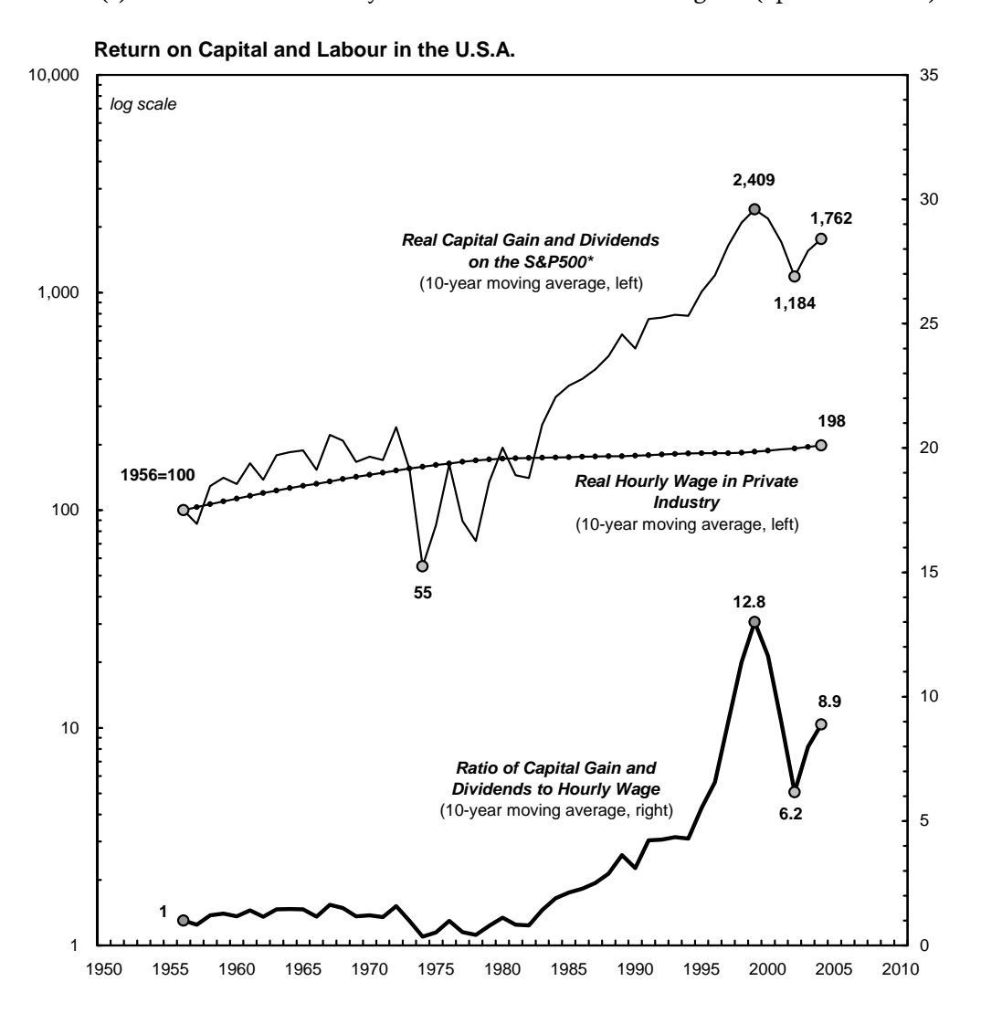
NOTE: real series are computed by deflating nominal data by the CPI. * Capital gains and dividends is the difference between successive values of the S&P500 Total Return Index. SOURCE: U.S. Bureau of the Census through Global Insight; Global Financial Data (www.globalfindata.com)

1. (25%) The top part of the figure below compares two U.S. time series. One series is the 'real' hourly wage rate in private industry. The other series, also expressed in 'real' terms, is the sum of capital gains and dividends earned from investing in the S&P500 index. The bottom part of the figure computes a 'differential' index: the ratio between the nominal wage and the nominal capital gains and dividends. (a) Explain the difference between nominal and 'real' measures of income. (b) Explain the meaning of a 'differential' index and how it differs from 'real' measures of income. (c) What conclusions can you draw from the data in the figure? (up to 500 words).